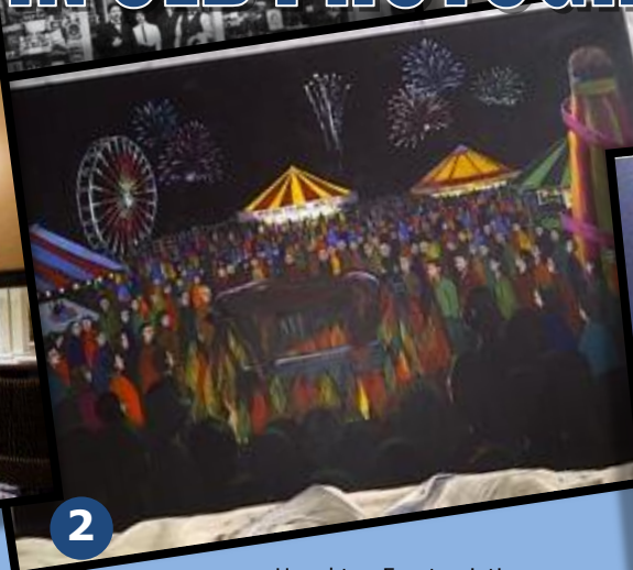
Houghton Feast painting